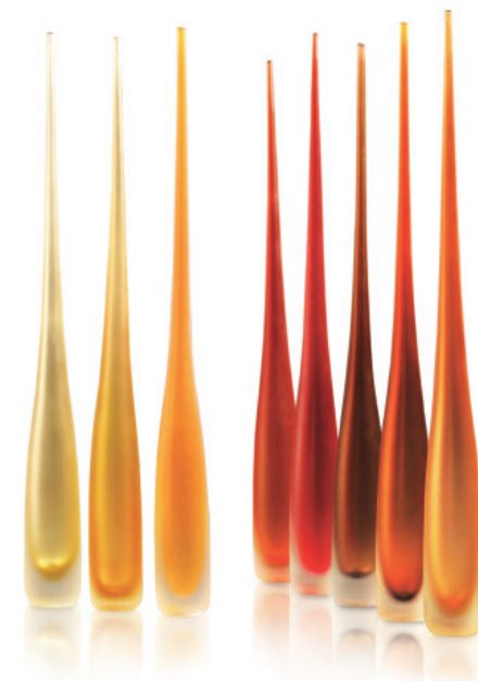
GLASS ACT Murano Luxury glass flutes at Luce della Citta can double as vases.